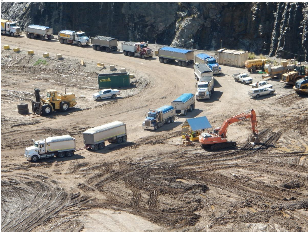
Close-up of vehicles queuing up.

It is also noted that at the time of the audit inspection the licensee's representative did not disagree with the auditors, when they showed him the area where the waste had not been covered in a previously covered area.