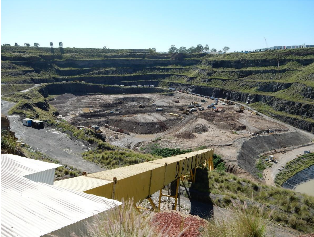
Waste filling operation at 9:37am on the day of the audit inspection indicating where filling operations were taking place in the north-east areas of the landfill